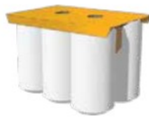
Paperboard Carrier Clip