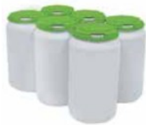
PakTech 100% Recycled HDPE