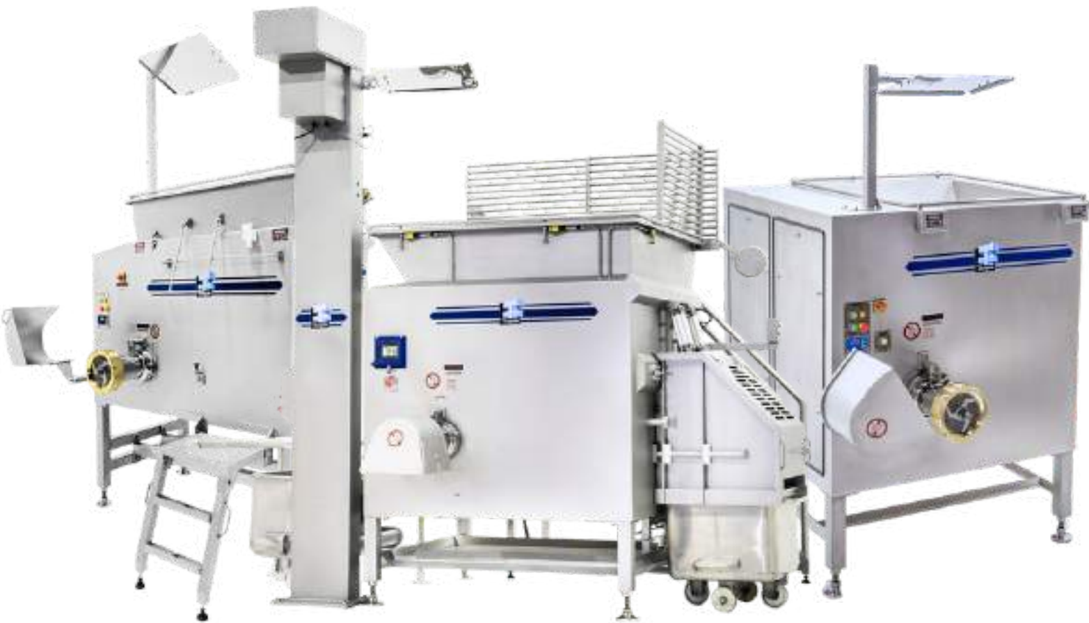
5 0 0 0 S E R I E S