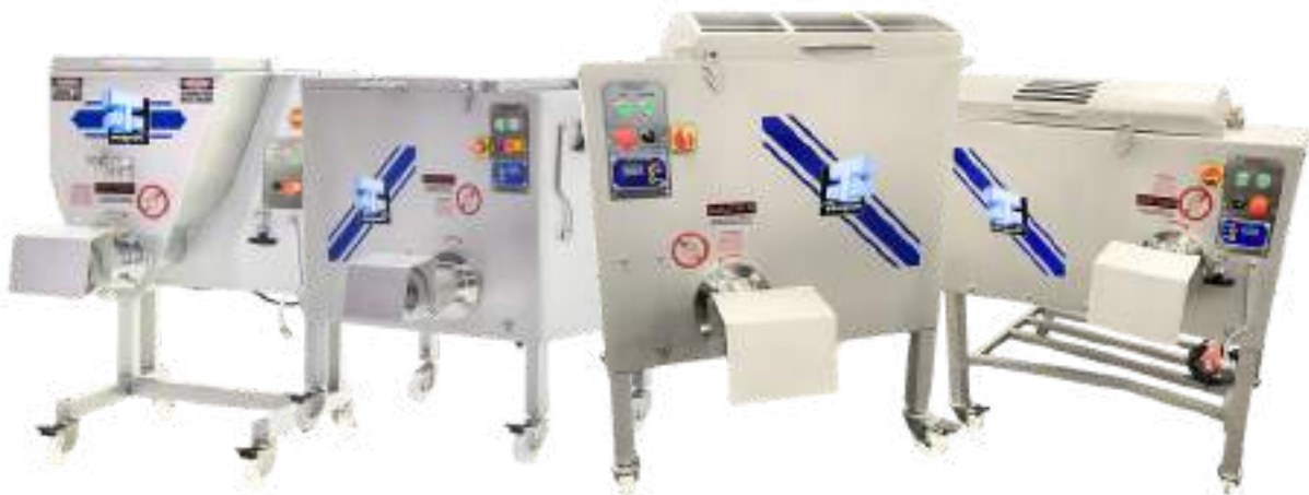
840 & 900 SERIES