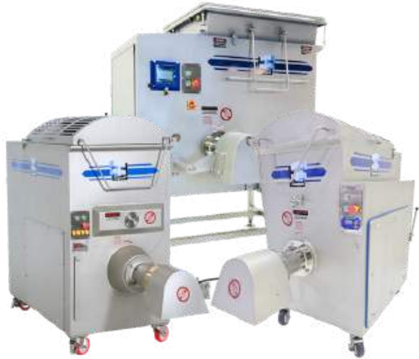
4 0 0 0 S E R I E S