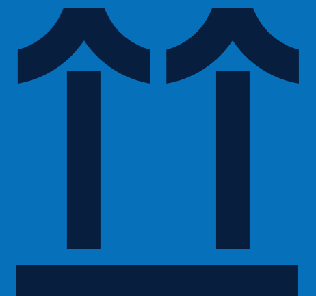
Figure 7: This way up

Contact us info@pakall.com.au 1300 472 525