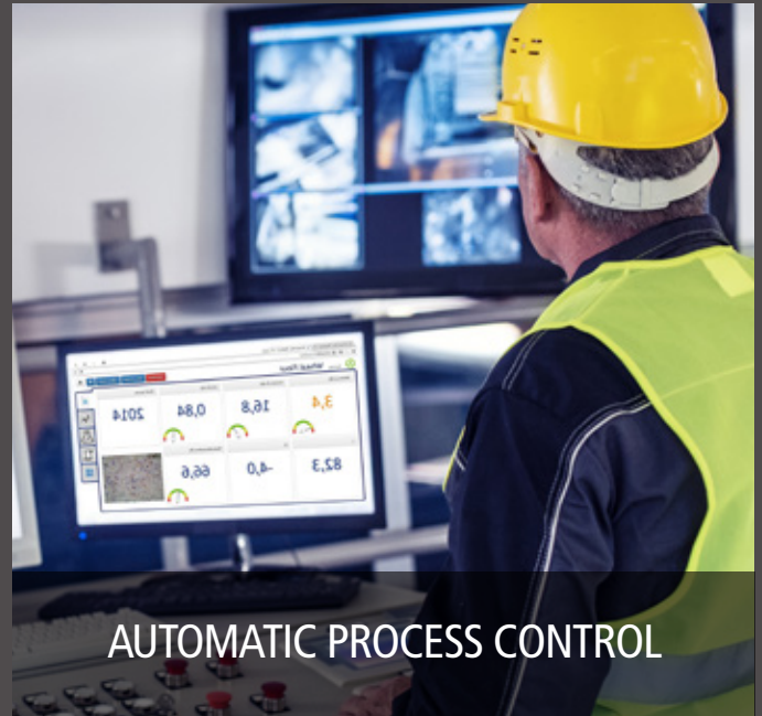
AUTOMATIC PROCESS CONTROL