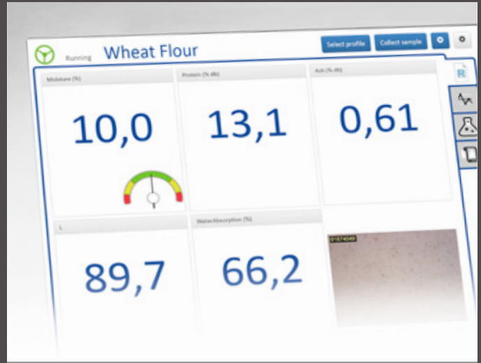
INTUITIVE GRAPHICAL USER INTERFACE