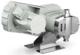
TORNADO® Rotary Lobe Pump