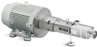
NOTOS® Multi Screw Pump