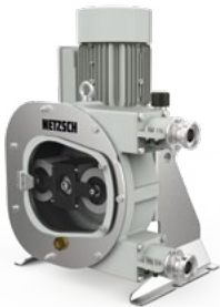
PERIPRO Peristaltic Pump