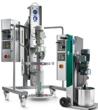
NETZSCH Barrel Emptying Systems