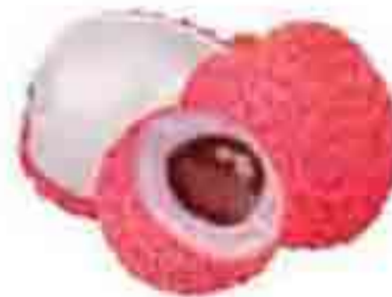
Lychee Puree - NFC Concentrate