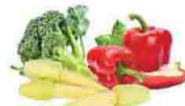
Vegetable Mix IQF