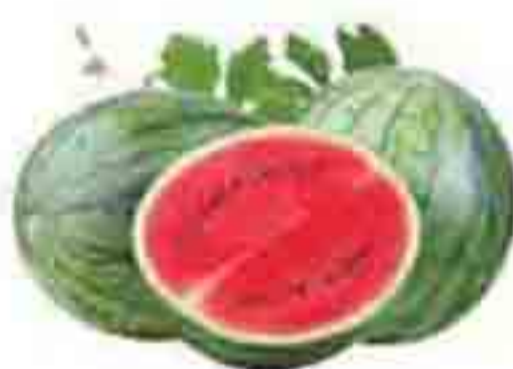
Watermelon Puree IQF