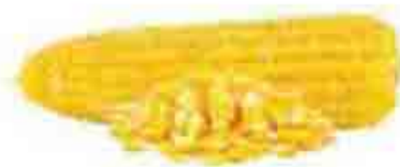
Sweet Corn IQF