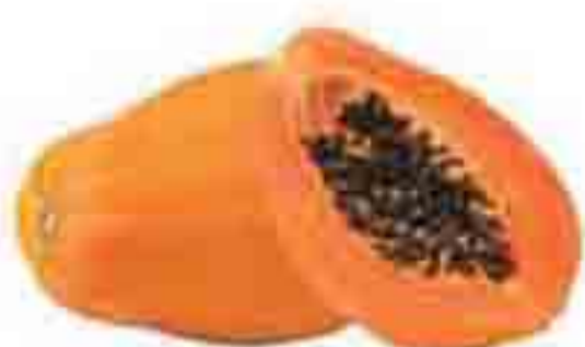
Papaya Puree - NFC IQF - Freeze Dried