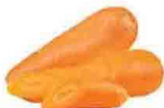
Carrot Puree - NFC IQF