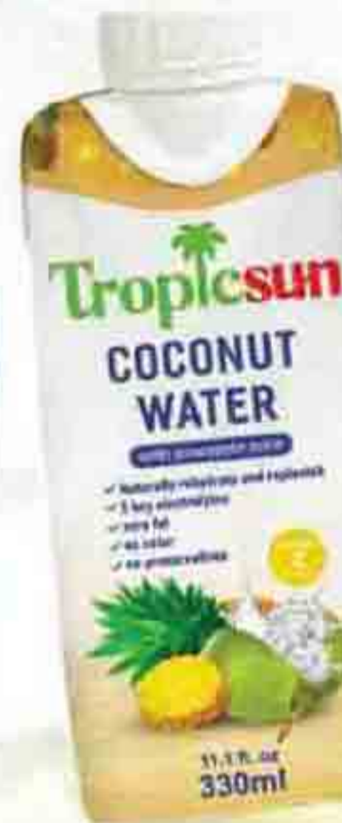
Coconut water with pineapple juice