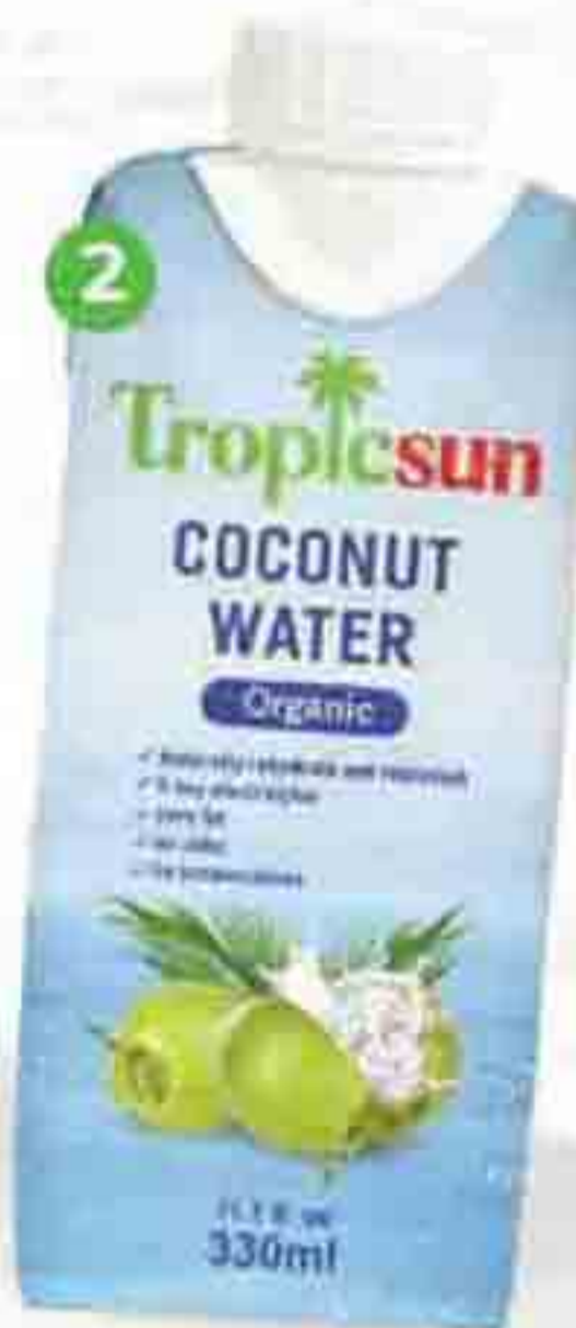
Organic pure coconut water