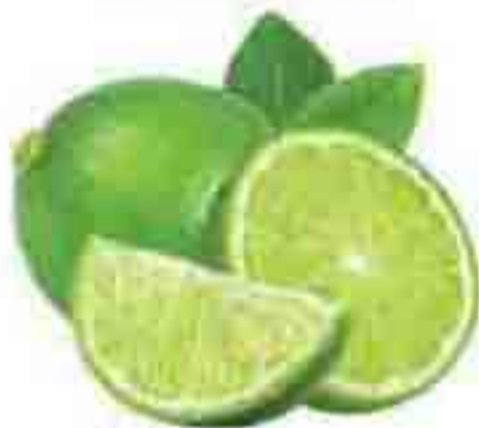
Lime Puree - NFC - Concentrate IQF - Freeze Dried