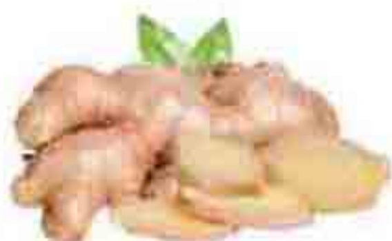
Ginger Puree - NFC IQF