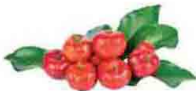
Acerola Puree - NFC Concentrate