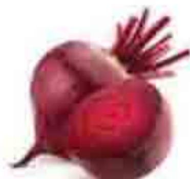
Beetroot NFC - Puree IQF