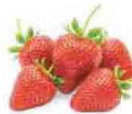
Strawberry Puree - NFC - Concentrate IQF - Freeze Dried