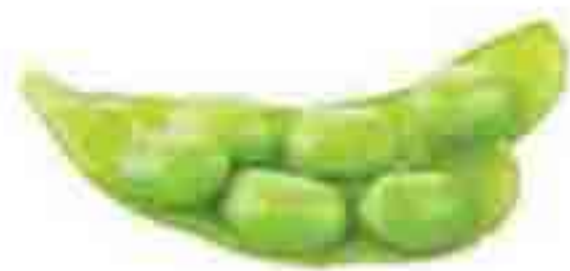
Edamame/ Mukimame IQF