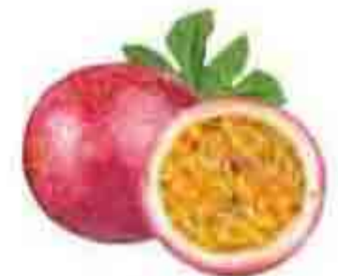
Passion Fruit Puree - NFC Concentrate