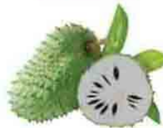
Soursop Puree - NFC