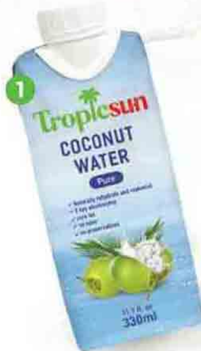
Pure coconut water