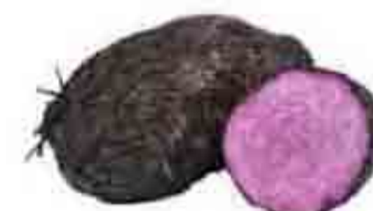
Purple Yam IQF