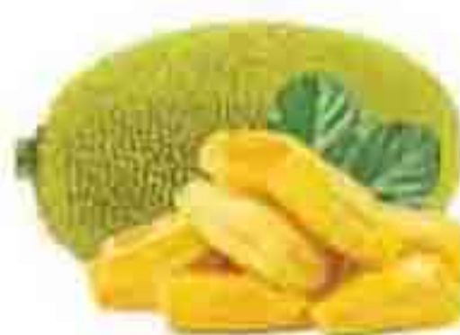
Jackfruit IQF - Freeze Dried