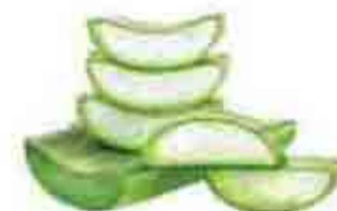
Aloe Vera Puree IQF