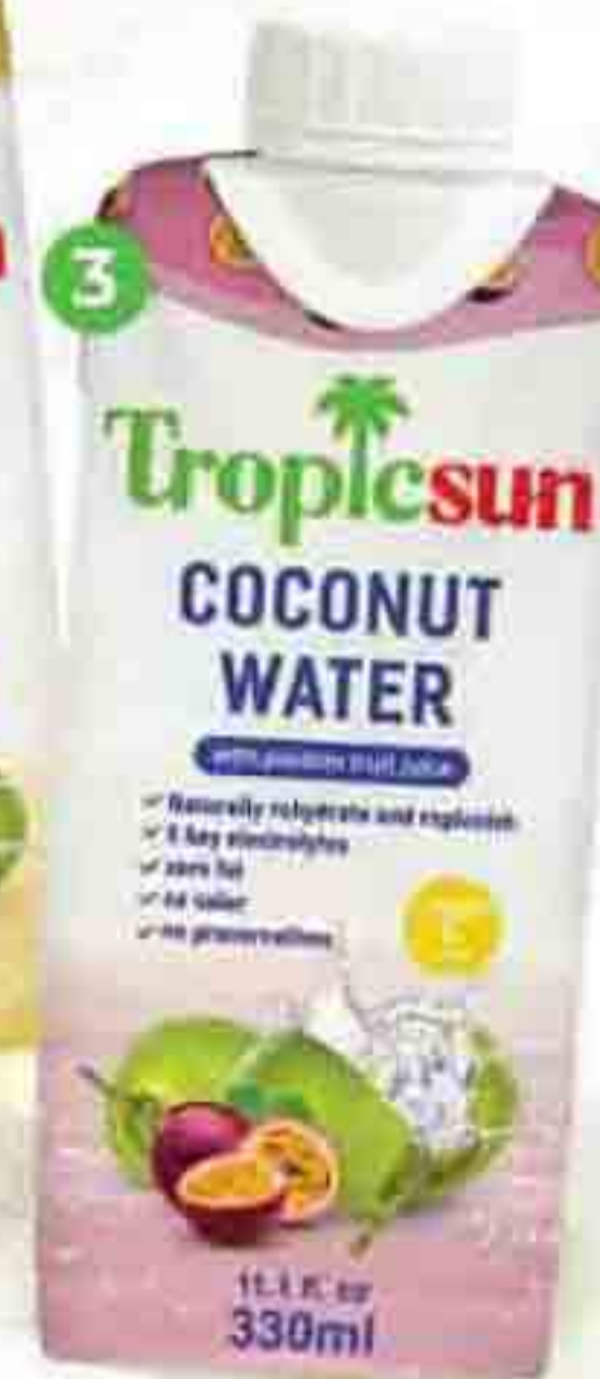
Coconut water with passion fruit juice