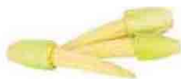
Baby Corn IQF