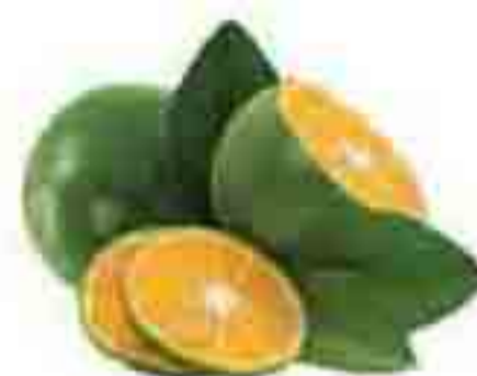
Calamansi NFC - Puree