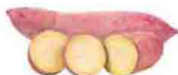
Sweet Potato IQF - Freeze dried