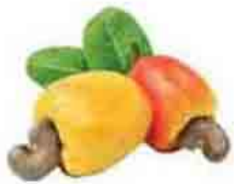
Cashew fruit NFC