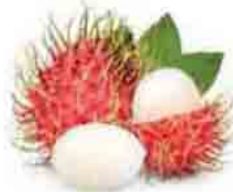
Rambutan Puree - Concentrate