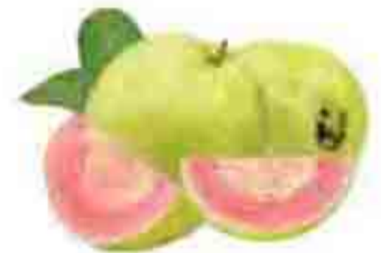
Guava Puree - NFC IQF