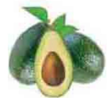
Avocado Puree - IQF Freeze Dried