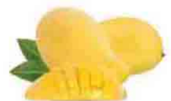
Mango Puree - Concentrate IQF - Freeze Dried