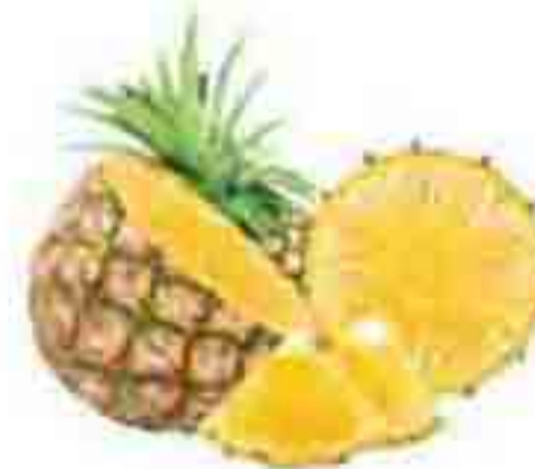
Pineapple Puree - NFC - Concentrate IQF - Freeze Dried