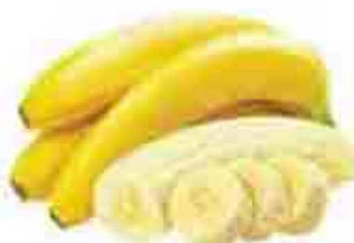
Banana Puree IQF - Freeze Dried