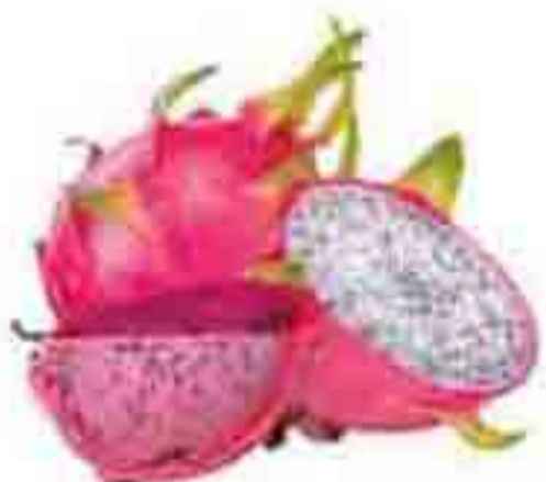
White/ Red Dragon Fruit Puree - NFC - Concentrate IQF - Freeze Dried