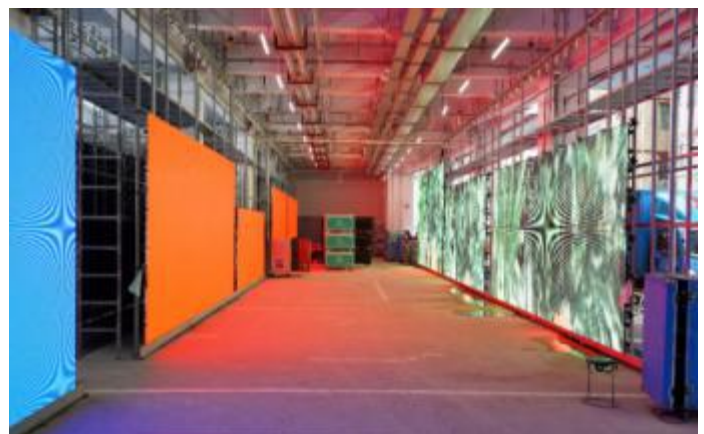
Outdoor Aging Test Workshop