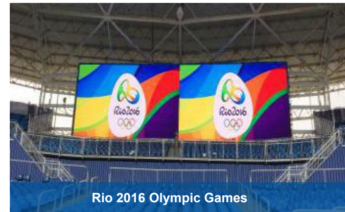
Rio 2016 Olympic Games