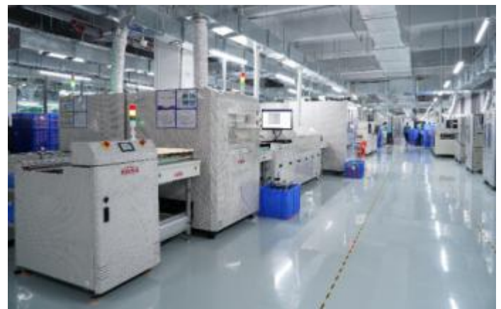
Indoor Cabinet/Module Assembly Workshop