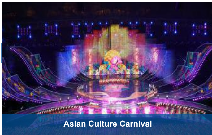
Asian Culture Carnival