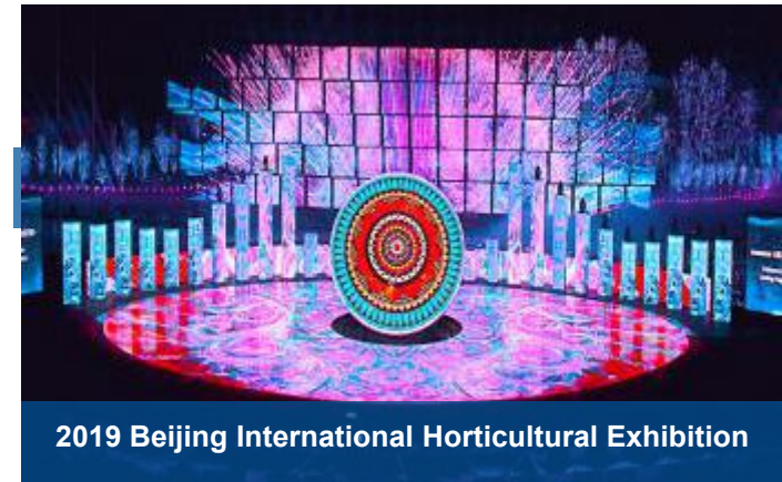
2019 Beijing International Horticultural Exhibition