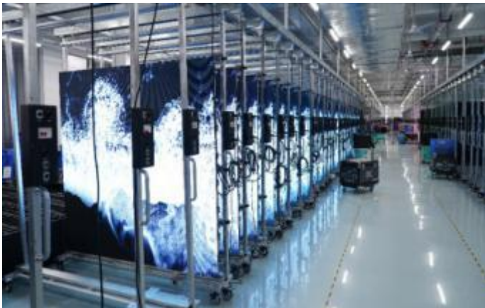
Indoor Aging Test Workshop