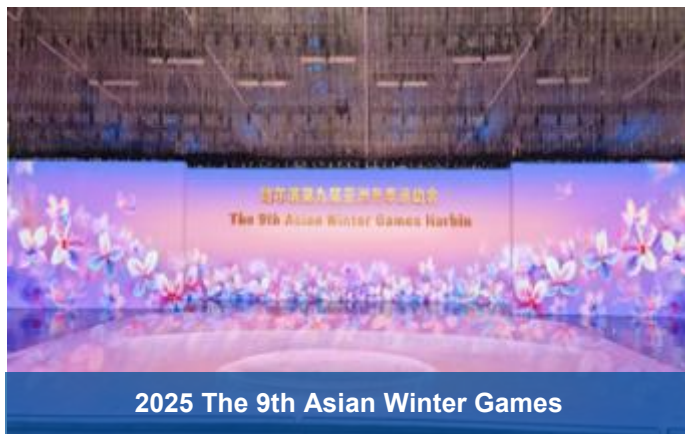
2025 The 9th Asian Winter Games