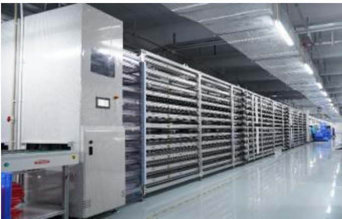
Outdoor Cabinet/Module Assembly Workshop