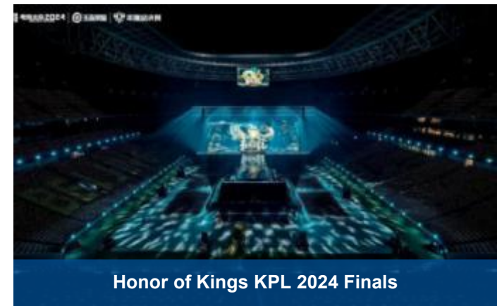
Honor of Kings KPL 2024 Finals