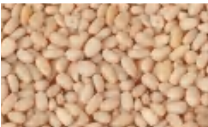
PINE NUT KERNELS