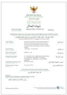
BPJPH HALAL (떡류, Rice Cake)