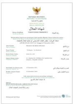
BPJPH HALAL (음료, Beverages)