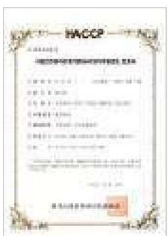
HACCP (음료, Beverage)