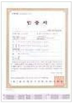
Organic Processed Food