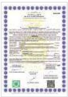
MUI HALAL (떡류, Rice Cake)