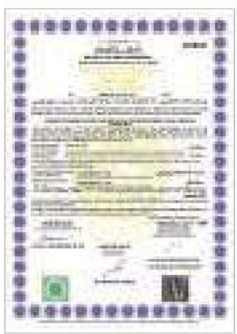
MUI HALAL (음료, Beverages)