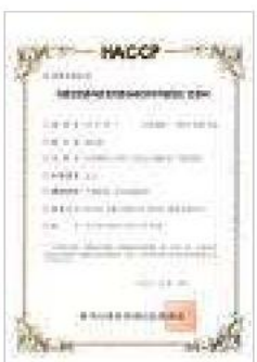
HACCP (소스, Sauce)