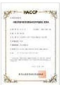
HACCP (떡류, Rice Cake)