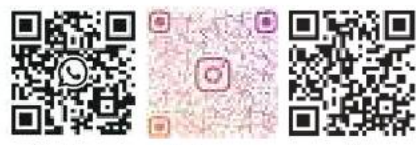
Whatsapp Instagram Web

HQ: (주)아람 F 1: 21, Daejeon-ro 1364beon-gil, Daedeok-gu, Daejeon, Republic of Korea WEB: www.aramfood.co.kr TEL: +82 42 624 1181 FAX: +82 42 624 1183 EMAIL: help@aramfood.co.kr