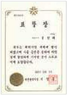
Award by Daejeon City