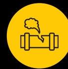
Nitrogen leak testing and helium leak testing