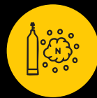
Nitrogen purging and inerting