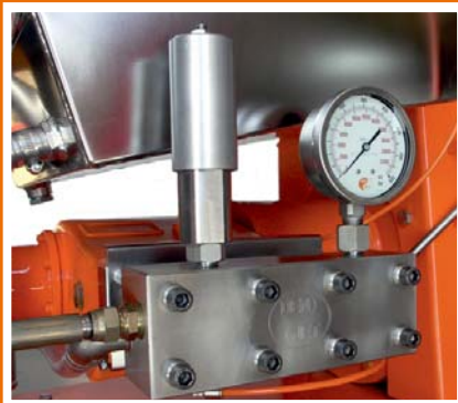
Stainless steel pump-head.