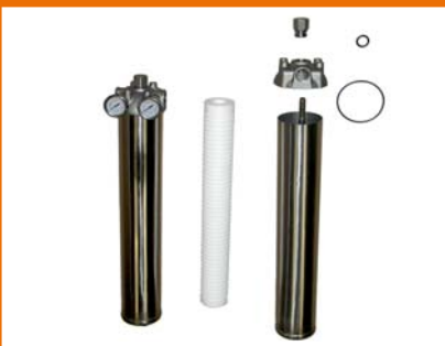
Strainers & Filtration.