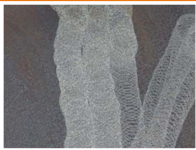
Water Blasting With Rotating Sapphire Jets.