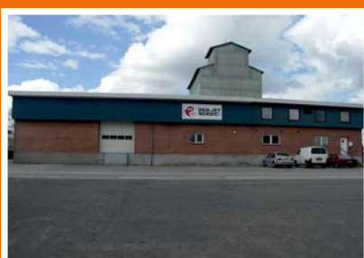
DEN-JET Factory Denmark