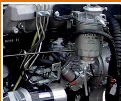
4 Cylinder Toyota Engine