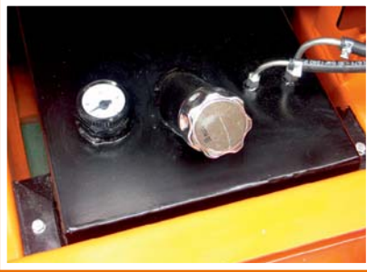
Fuel tank with level gauge