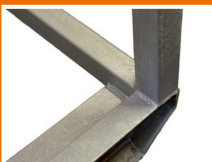
Hot Dip Galvanized Frame