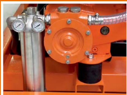
Built-on mechanical feed pump.