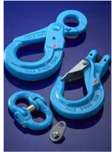
Lifting Chain Fittings & Digital Tags