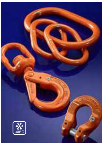
Offshore Container Lifting Fittings & RoV