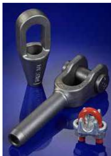
Wire Rope End Fittings