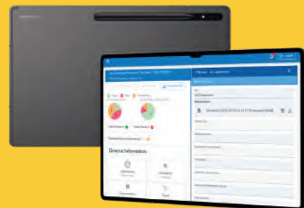
Optimised ITR for mobile and tablet